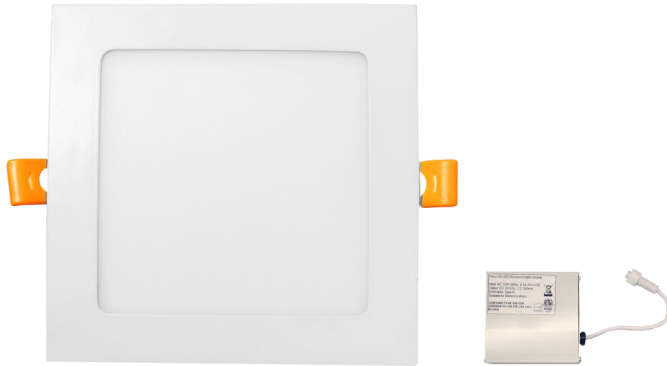
Junction box 1" thick included with fixture